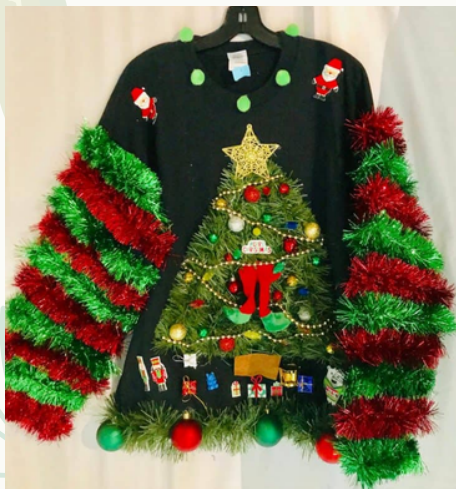
National Ugly Christmas Sweater Day, December 20

Your November and December Daily Logs are due by January 3rd. Please submit these to Diane Miles.